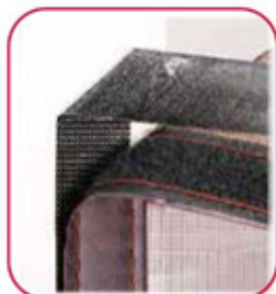
Full frame Heavy Duty Hook