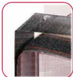
Full frame Heavy Duty Hook